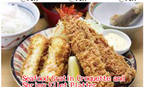
Seafood Gratin Croquette and Shrimp Filet Platter

Tartar Sauce 1000 5 (Including tax: 110 Yen)